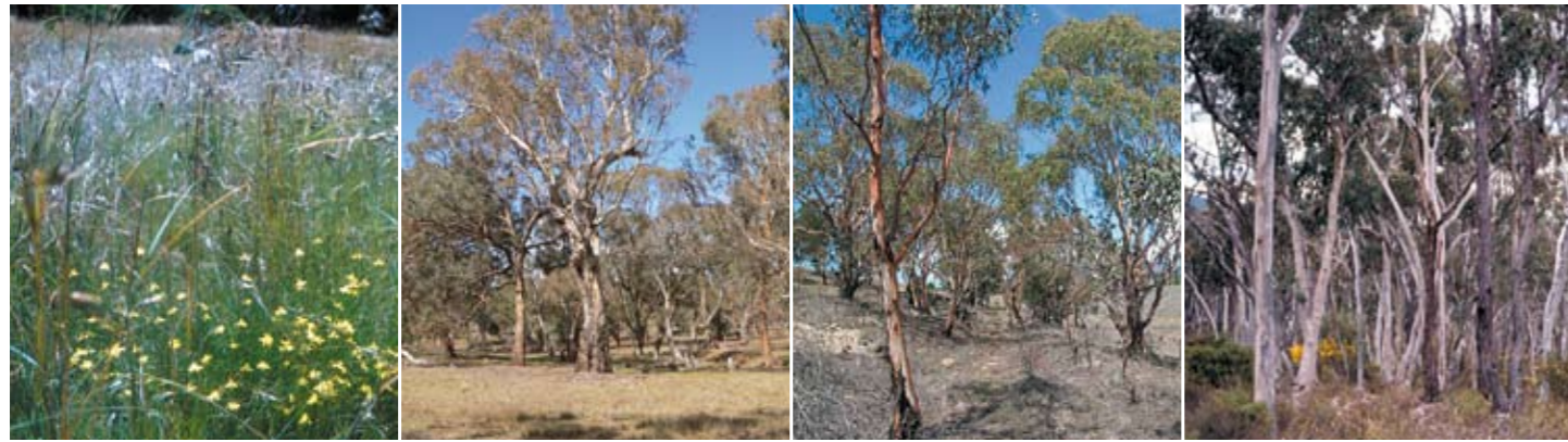
Section 1 Section 2 Section 3 Section 4