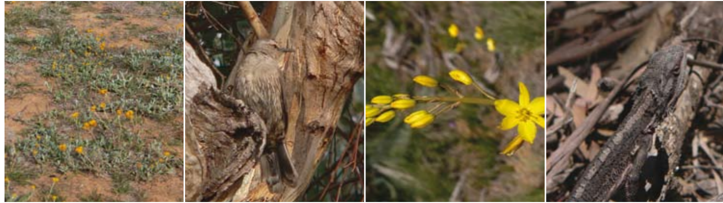
Section 1 Section 2 Section 3 Section 4

This planting guide for Burra Creek and tributaries has been produced to assist landholders and developers in making decisions about conserving what remnant native vegetation may be left, and providing a core list of indigenous and local species suited for rehabilitation or enhancement planting within the creek corridor and surrounds. It is one of a series produced by the Molonglo Catchment Group for catchments and sub-catchments of the Molonglo River. The planting guide has been prepared based on research and site visits to the Burra Creek at various points along its length.