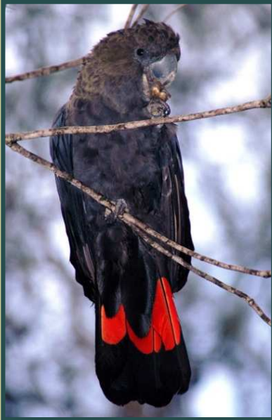
Glossy Black-Cockatoo: Stuart Harris