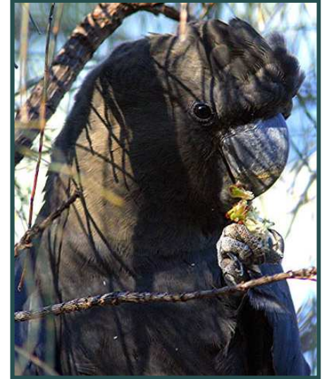
Glossy Black-Cockatoo: Geoffrey Dabb

The Glossy Black-Cockatoo is listed as vulnerable in NSW and the ACT. A number of factors have contributed to its vulnerability, including historical land clearing, ongoing loss of hollow-bearing trees, urbanisation and over-grazing. Its vulnerability is also related to its specialist feeding habits: it feeds exclusively on Sheoak species, which are particularly susceptible to browsing and lack of recruitment from inappropriate grazing. The Glossy Black-Cockatoo's main source of food in our region is the Drooping Sheoak.