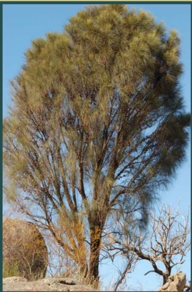
Drooping Sheoak: Greening Australia

K2C and its partners are aiming to increase Glossy Black-Cockatoo ( Calyptorhynchus lathami ) foraging habitat in our region. Greening Australia Capital Region will be coordinating the planting of 10 000 Drooping Sheoak ( Allocasuarina verticillata ) and Glossy Black-Cockatoo nest tree seedlings across 20 properties in the K2C region on behalf of K2C and its partners. These plantings will be completed prior to spring 2013 and will complement previous plantings in the ACT and future plantings along the Murrumbidgee corridor. This project has been assisted by the New South Wales government through its Environmental Trust.